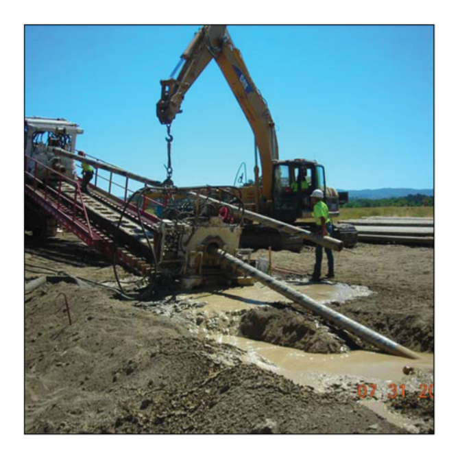
Figure 5. Adding drill stem for MSR HDD.

it. The carrier pipe "as-built" surveys showed the alignment met the specified requirements; the pressure tests also met the specified requirements. During the mandrel tests on the fiber optic conduits, it was found that at least two of the four passed the mandrel requirements.