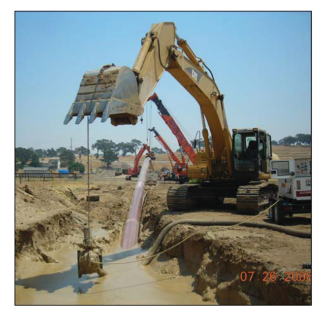
Figure 4. Paso Robles Turnout HDD Pullback.

At completion of each of the four HDD crossings, "as-built" surveys, pressure testing of the carrier pipe, and mandrel testing of the fiber optic conduits were performed. The mandrel test ensured that the conduit was intact and had maintained its round shape. The test consisted of pulling a ball or elliptical plug-shaped object, sized no less than 80-percent of the conduit's inner diameter, through