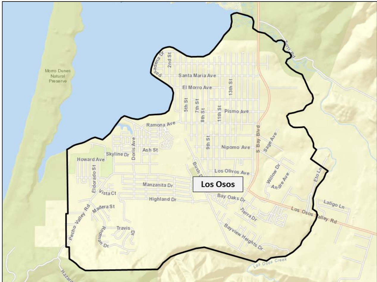
FIGURE 1-1: Los Osos Community Plan Area