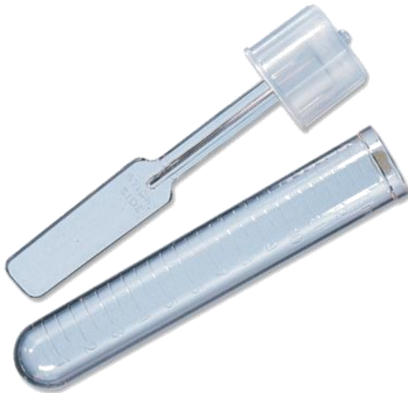
Figure 1 Tube with specimen collection paddle

After all three tubes have been collected place the tubes into the plastic bag. Specimens can remain at room temperature until delivered to the Public Health Laboratory. Be certain to complete laboratory requisition and place in the outside pocket reserved for paperwork only. Deliver to the Public Health Laboratory at 2191 Johnson Avenue, San Luis Obispo.