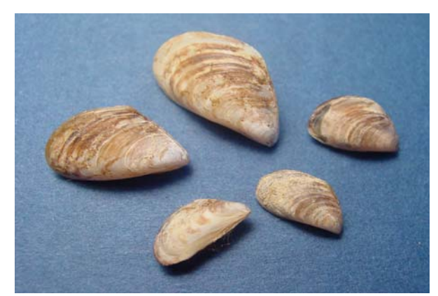
Quagga Mussels at various sizes