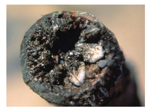
QMs clog pipes and intake structures causing severe damage that requires heavy annual maintenance

For Great Lakes water users with lake water intake structures, Park and Hushak (1999) report that total monitoring and control costs were $149 million from 1989 to 1994, and averaged $37 million annually from 1992 to 1994.