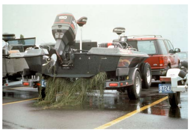
QMs can live on aquatic plants and be transported to non-infested waters