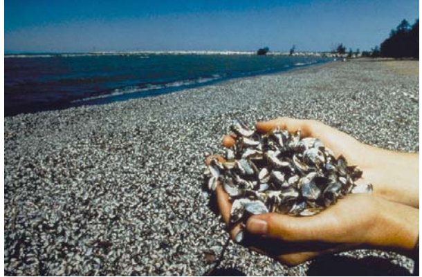
Mussel shell covered beach

QMs are prolific breeders that can overrun a lake causing hundreds of thousands of dollars worth of damage annually. One female QM can spawn 1,000,000 offspring annually. QMs rapid reproduction can negatively disrupt an aquatic ecosystem in a very short amount of time. Once QMs are introduced into a waterway, there is no way to fully eradicate the species. Preventing introduction is crucial.