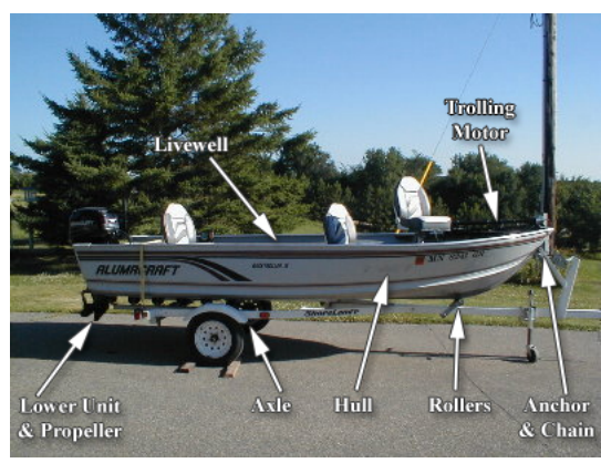
Boat Inspection Points

Santa Barbara County Parks staff began verbally screening boaters entering Cachuma Lake in January 2007. The screening provides information about recent lakes visited by boaters. By December 2007, Parks staff received training and began conducting visual boat inspections at Cachuma Lake. In March 2008, following a temporary lake closure prompted by the threat of QM infestation, Cachuma Lake began requiring all private