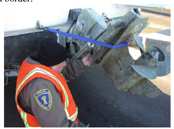
California Department of Food and Agriculture Boat Inspection

Natural resource and recreation agencies across North America conduct boat entry inspections (even where mussels have invaded). Inspections are also conducted by the CA Department of Food and Agriculture at the California border.