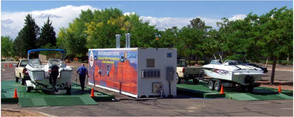
Hydro Engineering Inc. Decontamination Station

Vessel decontamination in high pressure washing stations is effective at killing QM larva and either killing or removing adult mussels. Decontamination stations are in use by the Department of Food and Agriculture at the California/Arizona border and have been installed at Lake Mead and will likely be installed soon in Southern California by the Metropolitan Water District.