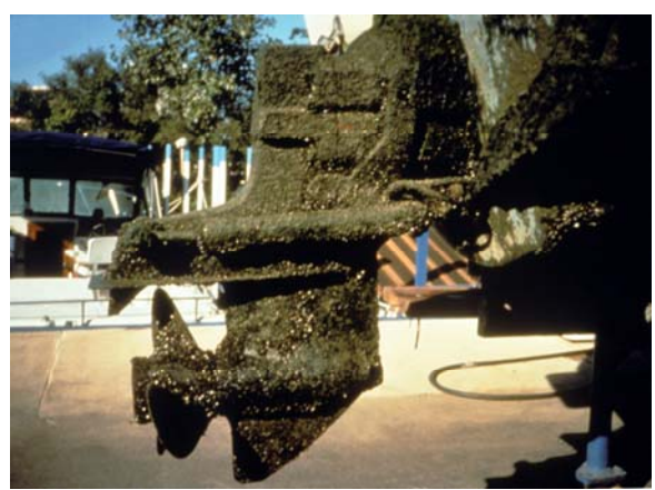
QMs attached to a boat motor

For nearly 20 years, QMs have spread across the US and have entered California waterways (Attachment 1). In January 2007, QMs were discovered in Lake Mead and the Colorado River system. Recently QMs have been found in 20 South West lakes and water ways (Attachment 2).