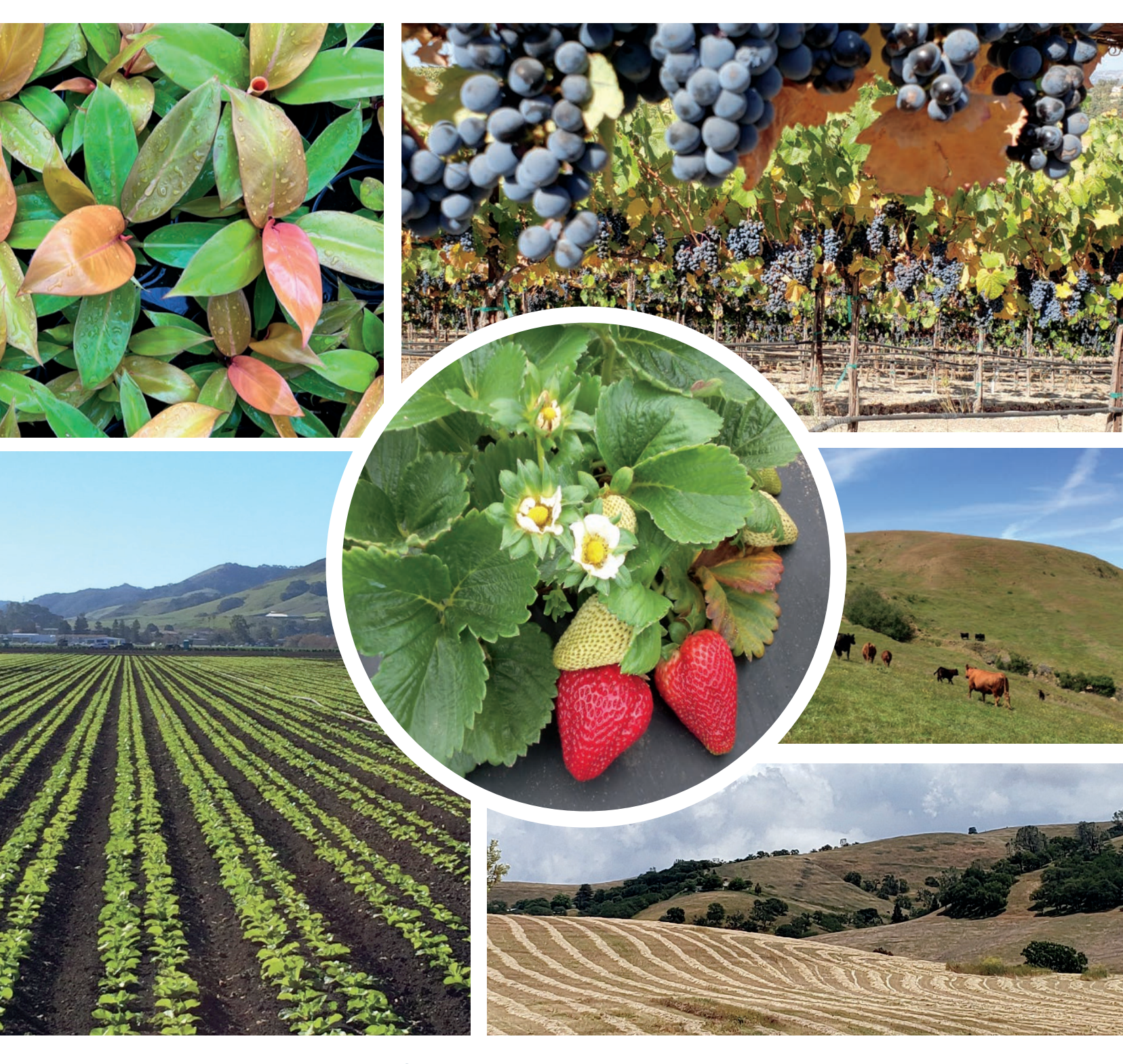
Department of Agriculture/ Weights & Measures