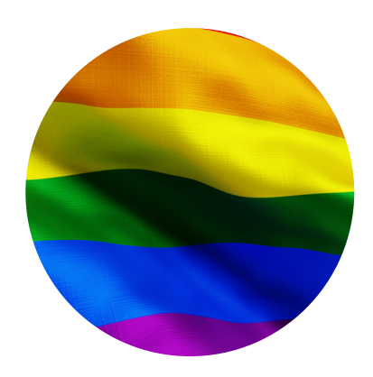
LGBTQIA+ AFFIRMING RESOURCES CLICK HERE