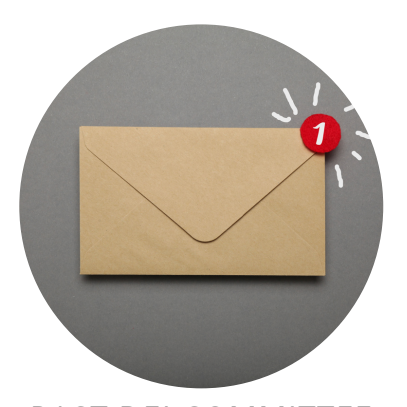
PAST DEI COMMITTEE PUBLICATIONS CLICK HERE