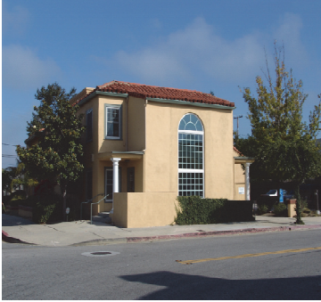
San Luis Obispo County Pension Trust 1000 Mill Street San Luis Obispo, CA 93408 805/781-5465

Published by the San Luis Obispo County Pension Trust