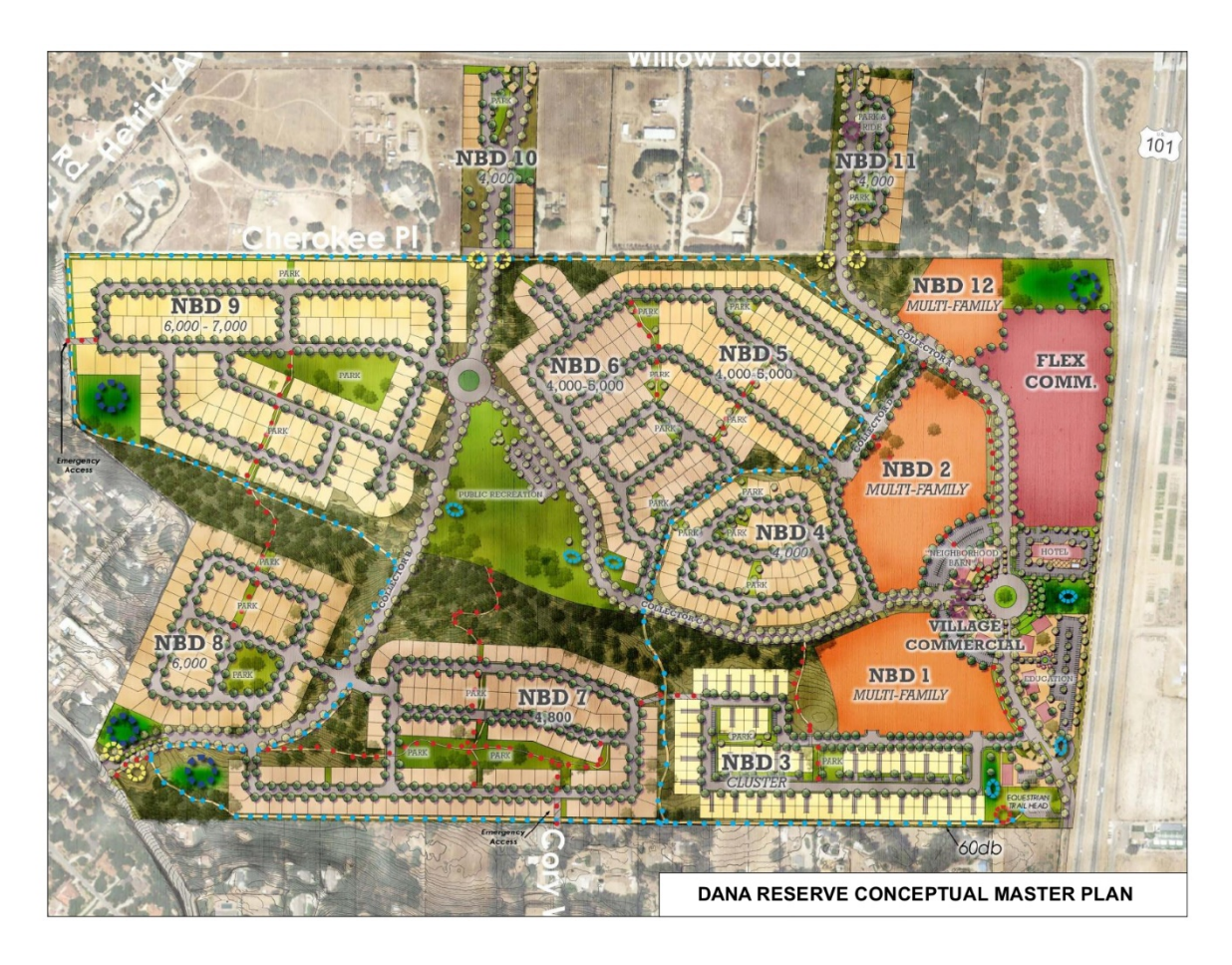
The impact of implementation of the plan proposed by developer