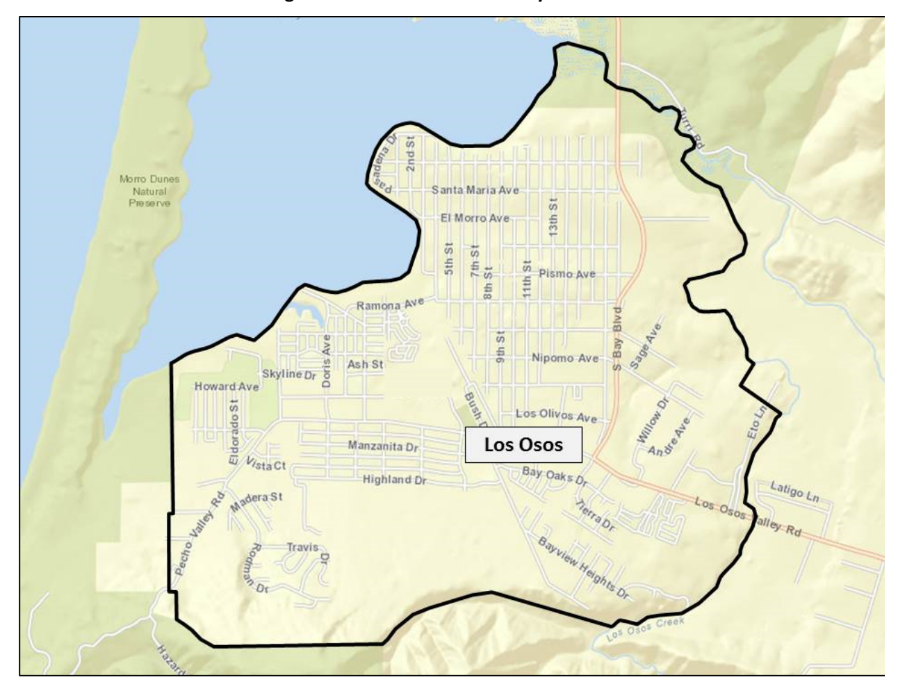
Figure 1-1: Los Osos Community Plan Area