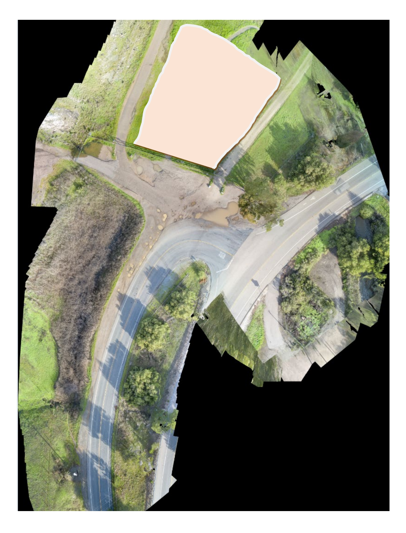
Ontario Road at Johnson Ranch Open Space; South Higuera Street intersection (New Parking area)