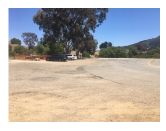
a) Johnson Ranch entrance looking east