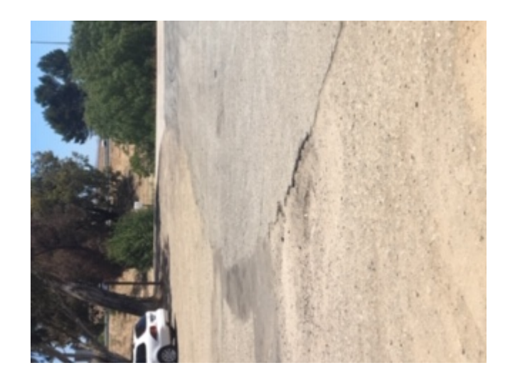
c) Johnson Ranch approach