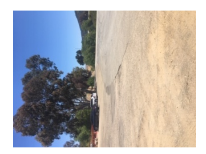
b) Johnson Ranch entrance looking east