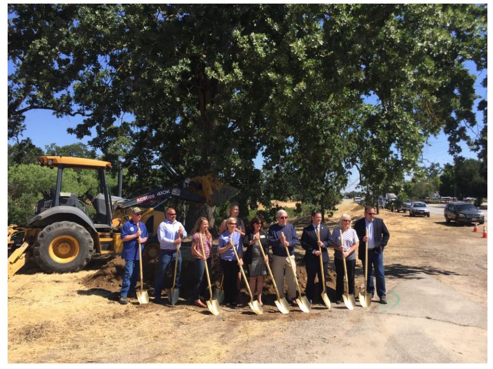
Templeton CSD Upper Salinas Conjunctive Use Project Groundbreaking Ceremony 6/8/2018