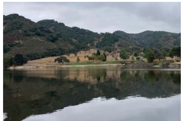
Full Lopez Lake 2023 after winter storms (Swim area)

Source water for Lopez Project comes from Lopez Lake, located approximately 10 miles east of Arroyo Grande. The lake is part of a 67-square mile watershed and has a storage capacity of 49,200 acre-feet, or about 16 billion gallons of water. The water is conveyed 3 miles by pipeline to the Lopez Terminal Reservoir adjacent to the Lopez Water Treatment Plant (WTP). The water is held in the Terminal for over a month before entering the WTP. During that time, particles settle out of the water, and exposure to sunlight helps reduce the risk of bacterial and viral contamination from human contact in Lopez Lake.