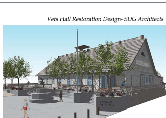
Vets Hall Restoration Design- SDG Architects