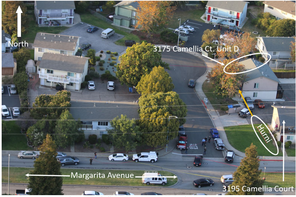
Figure 8. Approximate area of movement of Officer Hurni as he retreated south from his patrol vehicle towards 3195 Camellia Ct. Officer Hurni fired 17 rounds as he moved. The general trajectory of those rounds is illustrated by the yellow arrow.