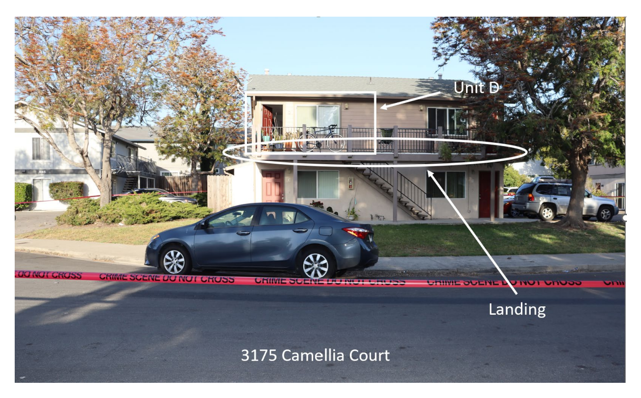
Figure 1. 3175 Camellia Court, depicting Unit D, second story landing, and stairwell.

The team arrived at the location in four vehicles. Three of the vehicles were unmarked and not readily identifiable as associated with law enforcement. Detectives Benedetti and arrived in an unmarked vehicle and parked in the cul de sac of Camellia Court. Sergeant Aaron Schafer arrived alone in an unmarked vehicle and parked behind a red truck near the southwest corner of Camellia Court. Detectives Orozco and Womack arrived together in Womack's unmarked Ford Explorer sports utility vehicle. They parked behind a blue sedan at the southeast corner of Camellia Court. Officer Hurni arrived alone in a distinctly marked Ford Explorer and parked in the parking lot of 3175 Camellia Court just south of the second story shared landing of Units A and D. He parked directly in front of Girons GMC Envoy. Officer Hurni's distinctly marked police SUV was visible from the south end of the Units D & A landing.