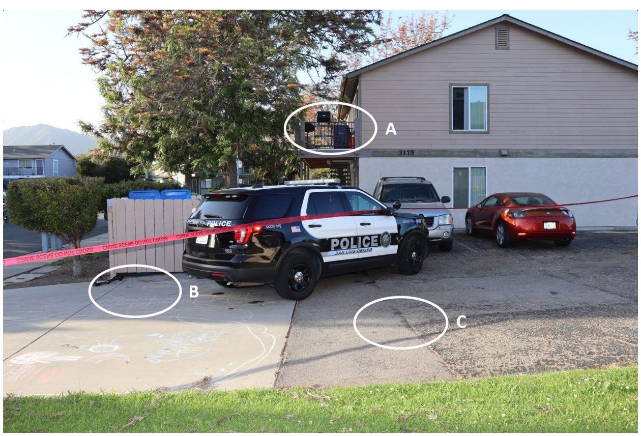
Figure 7. Photo depicting (A) landing where Giron was positioned, (B) Officer Orozco's position during his first shooting episode (note .40 mm launcher on ground), and (C) location of Officer Hurni when he began to shoot at as he retreated south.