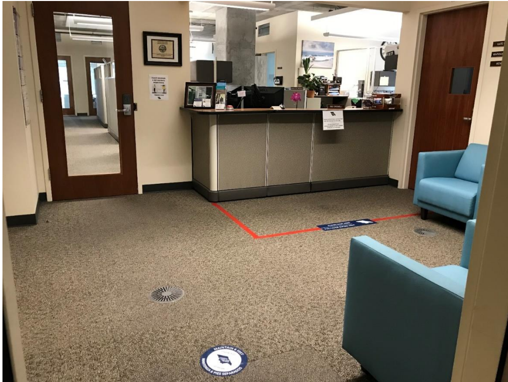
Example of floor decals