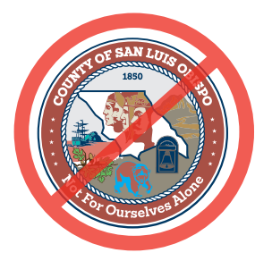
Do not change the colors.